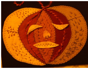
Pumpkin, Sue Punnett

As Covid-19 restrictions continue to prevent indoor meetings, Craft Group members have turned to meeting via Zoom. Whilst not the same as face to face meetings, it has provided a means of keeping in touch with each other in these difficult times.